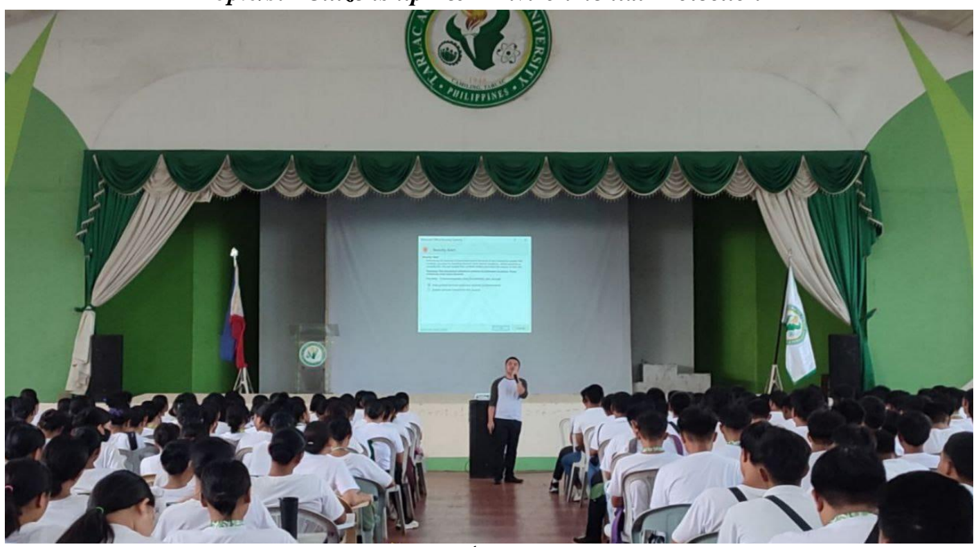
Topic/s: "Citizenship" & "Environmental Protection"

Two (2) topics were discussed during the 3<sup>rd</sup> phase of the NSTP Common Module to all the NSTP Students from the three components of NSTP namely: Civic Welfare Training Service (CWTS), Literacy