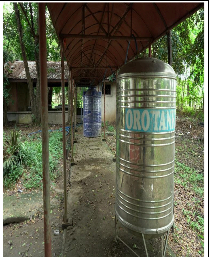
Example of Toxic Waste Treatment Facility